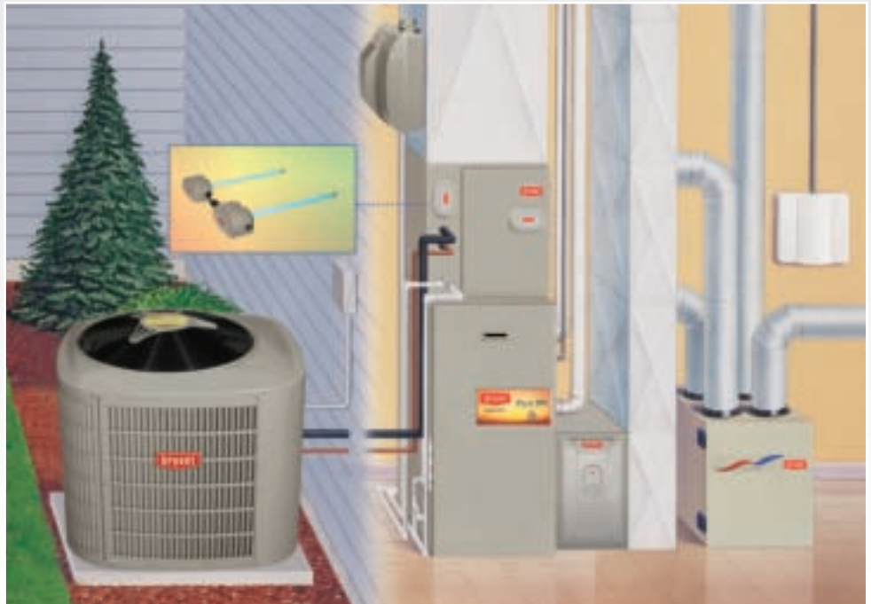
Central Air Conditioner and Gas Furnace System