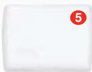
Remote Room Sensor