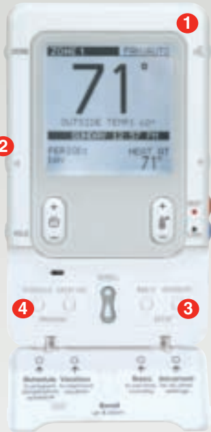
Evolution™ Zone Control